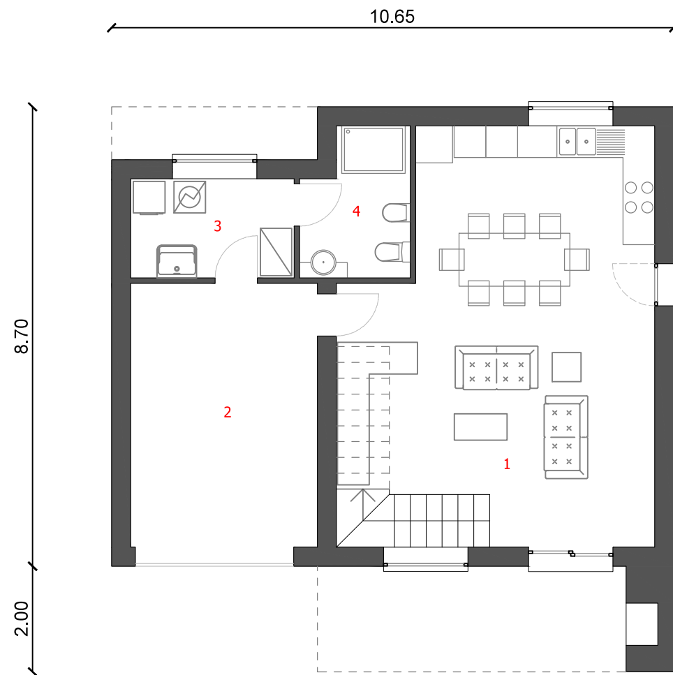
PIANTA PIANO TERRA