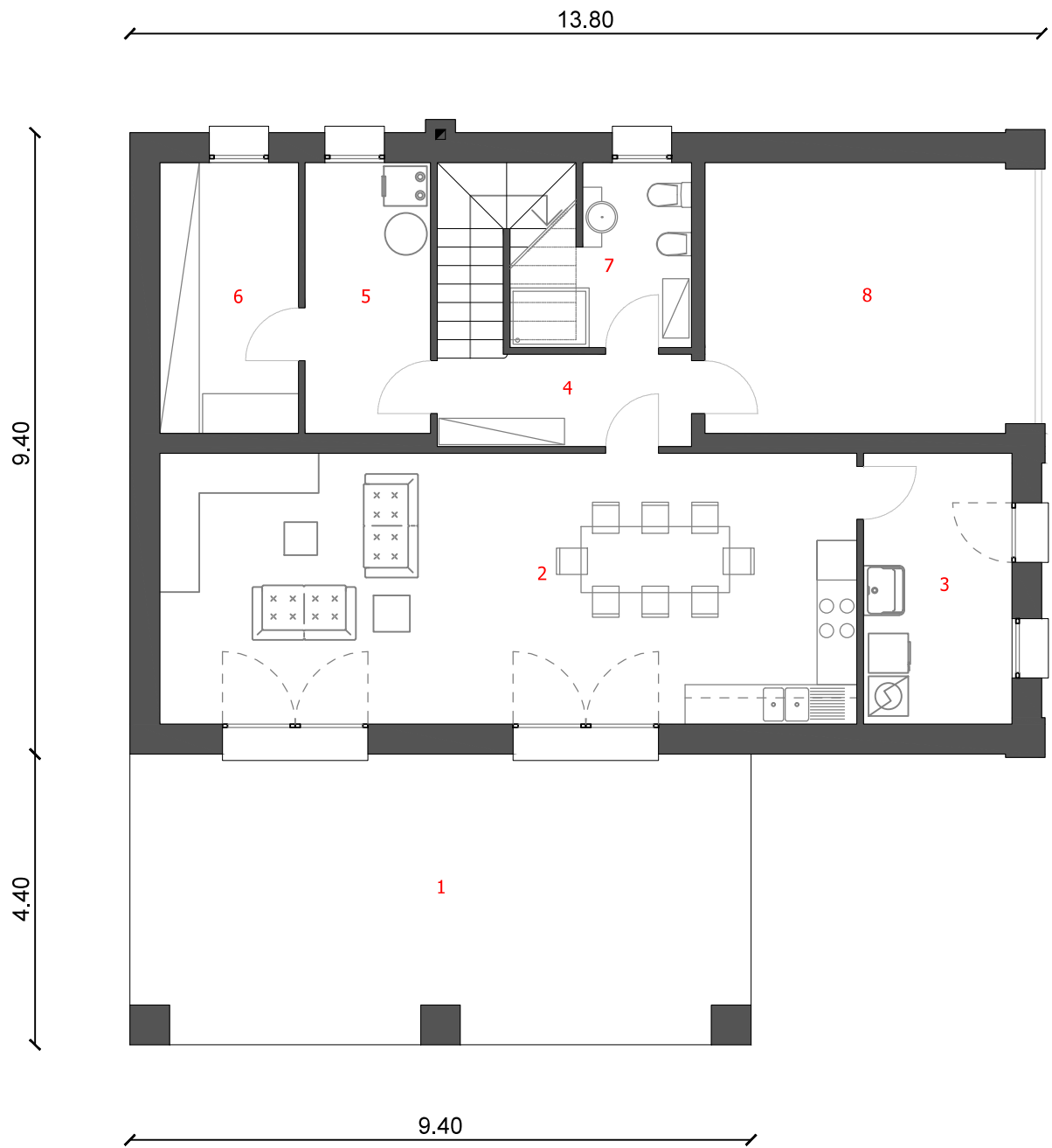
PIANTA PIANO TERRA